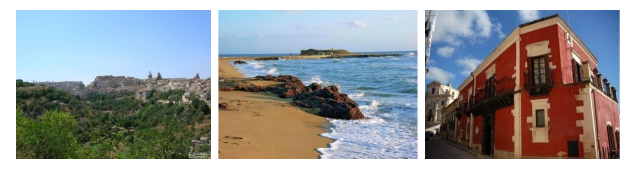
During this tour you can decide the difficulty level of the excursions yourself. All walks follow easy routes without any real technical difficulties and are feasible for those who have some walking experience and are in a good physical condition. Driving times are limited to the minimum – and follow the most beautiful routes. Walking times: approx. 2 to 5 hours a day.

If you want you can spend some extra days in the wonderful resort of Taormina, halfway between the Mediterranean Sea and the impressive Mount Etna, one of Italy's most scenic locations, which boasts one of the most spectacular Greek theatres in the world and a very charming old town centre. Views of Mount Etna are unforgettable!